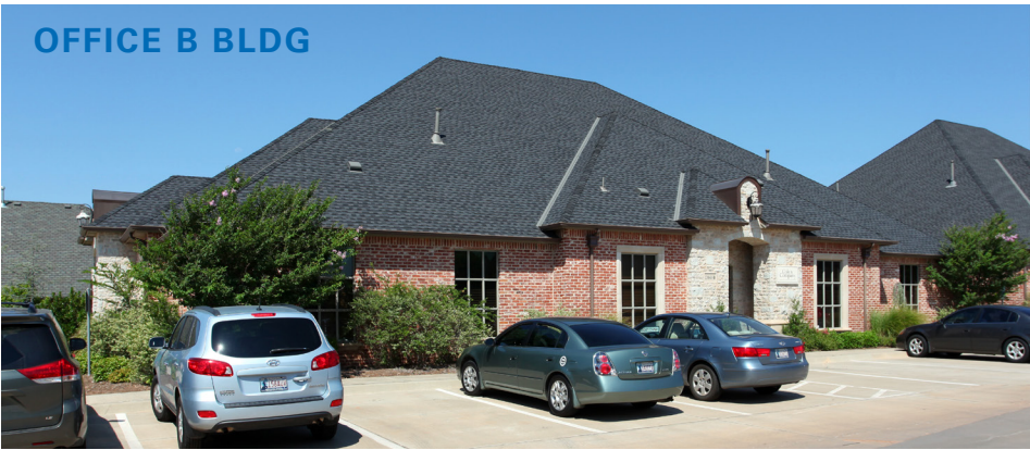
OFFICE B BLDG